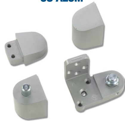
TH1114U US ALUM

To order pivot: For LHRB door order RH pivot For RHRB door order LH pivot