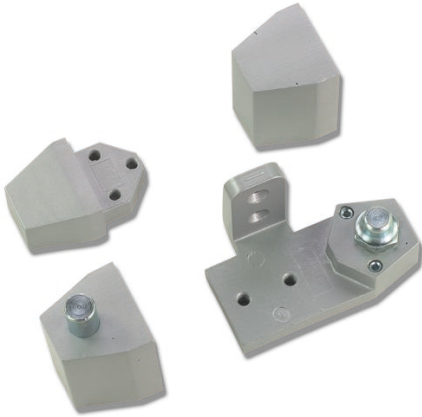
TH1110 ARCH / VISTAWALL STYLE