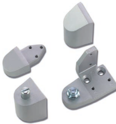
TH1112 AMARLITE STYLE